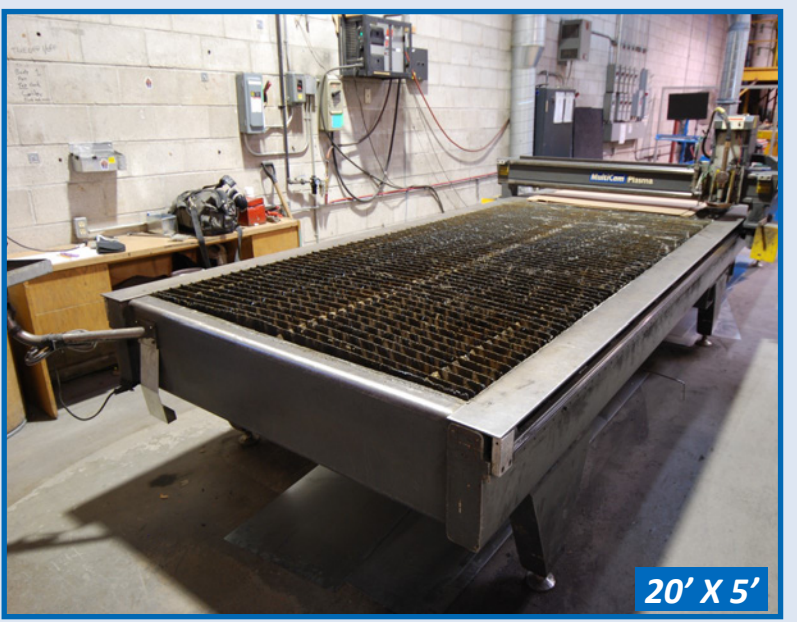
MULTICAM PLASMA CUTTER

Online Auction Only: Bidding Ends Friday July 15, 12:00PM (ET)