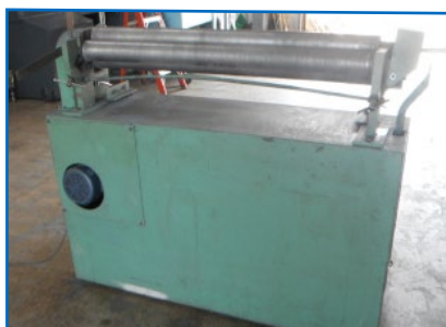
4' PLATE BENDING ROLL