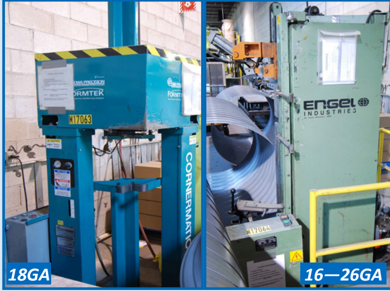
IOWA PRECISION CORNER MACHINE & ENGEL PITTSBURGH SEAMER