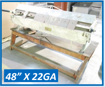
BOX & PAN CLEAT BENDER