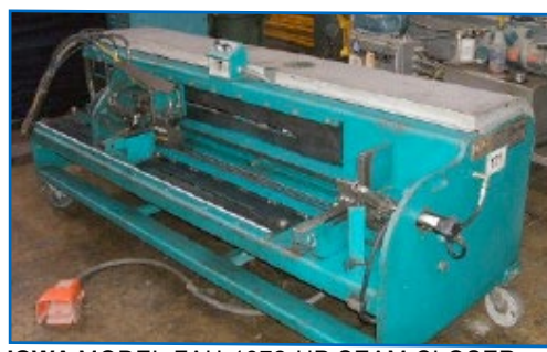
IOWA MODEL FAH-1872-HP SEAM CLOSER