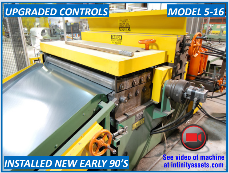
ENGEL HVAC COMPLETE COIL/DUCT MANUFACTURING LINE