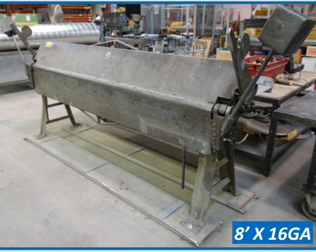
BROWN BOGGS MODEL 8-16 HAND BRAKE