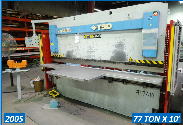
FABMASTER YSD MODEL PPT-77-10 HYDRAULIC PRESS BRAKE