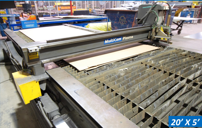
MULTICAM PLASMA CUTTER