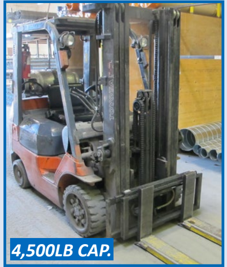
TOYOTA MODEL 7FGU25 FORKLIFT