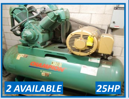
CHAMPION R SERIES COMPRESSOR