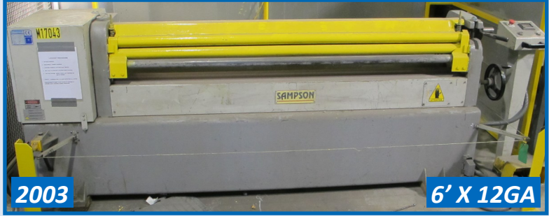
SAMPSON-AKAYPAK MODEL MRM-640 PLATE BENDING ROLL

Visit infinityassets.com to view complete specs & additional photos