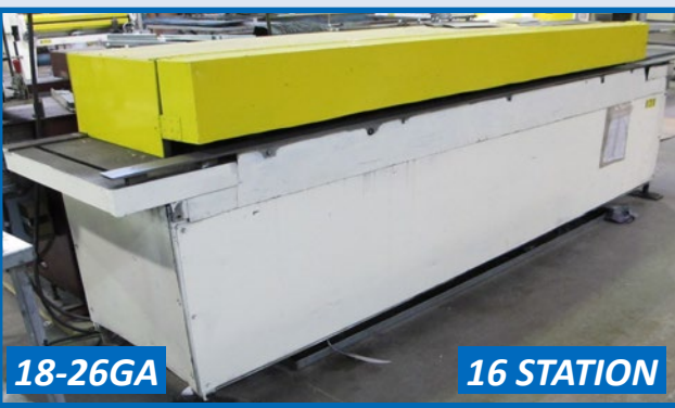
ENGEL INDUSTRIES MODEL M-1640 TDF ROLL FORMER