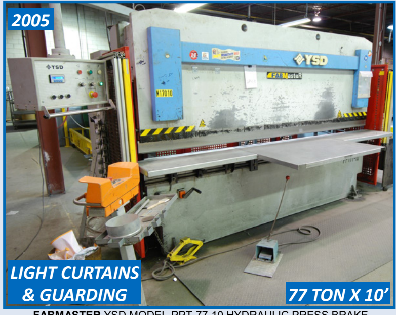
FABMASTER YSD MODEL PPT-77-10 HYDRAULIC PRESS BRAKE