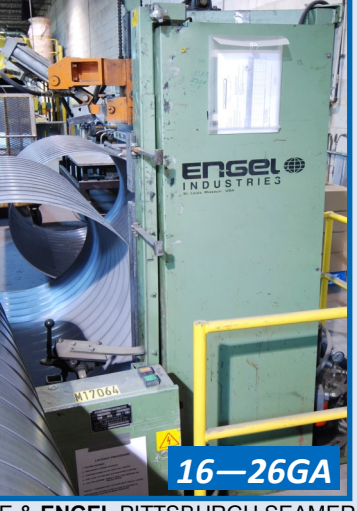
IOWA PRECISION CORNER MACHINE & ENGEL PITTSBURGH SEAMER