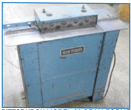
PITTSBURGH MODEL 20 SEAM FORMER