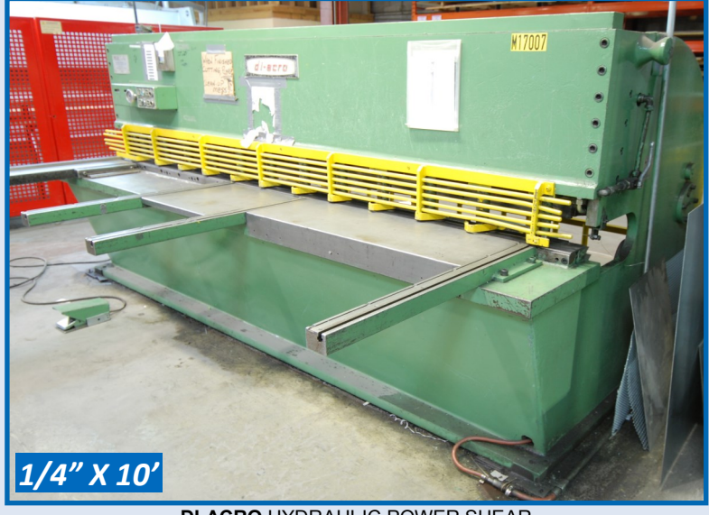
DI-ACRO HYDRAULIC POWER SHEAR

Visit infinityassets.com to view complete specs & additional photos